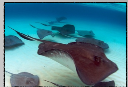
Stingray City Dive Friday Afternoon* 1 Tank, 1:30PM, US$75

For more info and to Sign Up for these Extra Trips, please check with the Front Desk