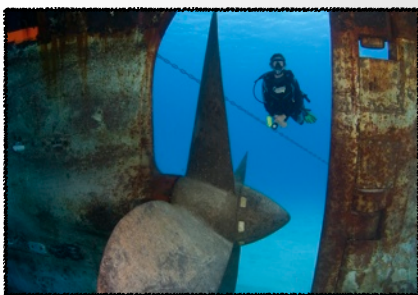
Kittiwake Wreck Dive Tuesday Afternoon* 1 Tank, 2PM, US$95

Thursday, 1 Tank Night Dive, US$75 inc UV light