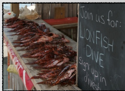
LionFish Culling Trip Thursday Afternoon PM 2 Tank, 1PM, US$50